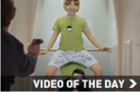
VIDEO OF THE DAY ➔